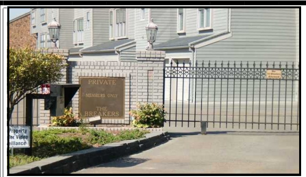
VOLUME 5, ISSUE 7