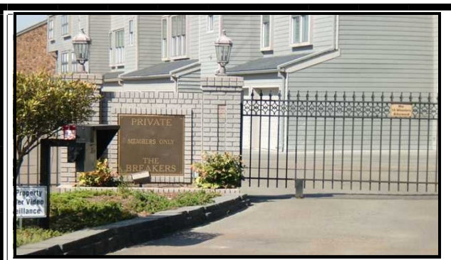
VOLUME 5, ISSUE 5