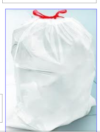
Tied Trash bags only....no cans ...set out MORNINGS of Mondays and Thursdays between 6 and 9 am. <u>Should you put your trash out any other time than</u> this, you will be subject to be fined 50% of your monthly association dues.

Keep our rocks on the big water side clean by not throwing trash off your deck.