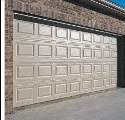
Keep garage doors down at all times when not in use.

<u>For a neat and</u> <u>uncluttered neighborhood</u> <u>appearance, Please keep</u> <u>all carports and entries</u> <u>free from items that need</u> <u>to be stored and out of</u> <u>sight.</u>