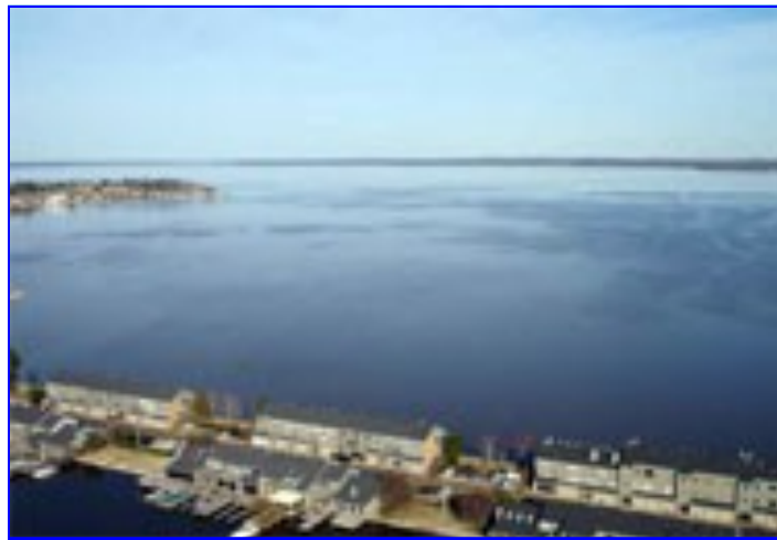
THE BREAKERS ON THE RESERVOIR