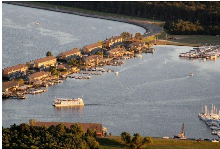
THE BREAKERS ON THE RESERVOIR