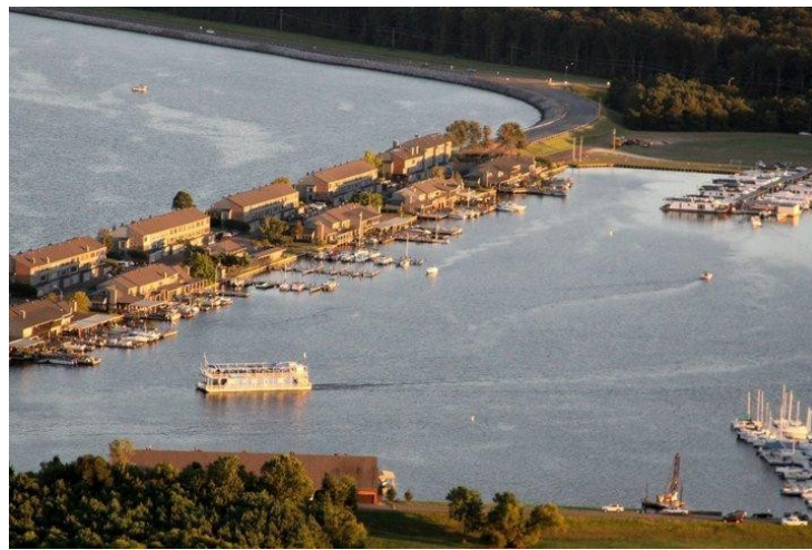
THE BREAKERS ON THE RESERVOIR