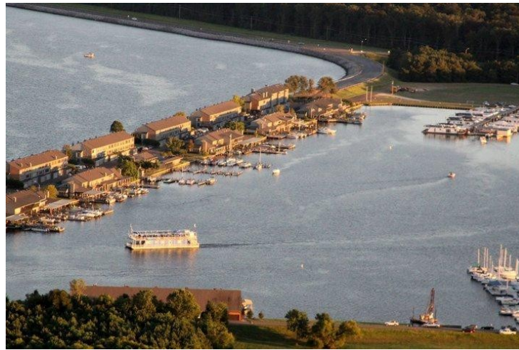
THE BREAKERS ON THE RESERVOIR