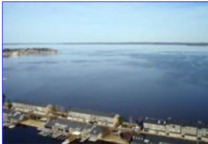
THE BREAKERS ON THE RESERVOIR