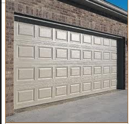
Keep garage doors down at all times when not in use.

For a neat and uncluttered neighborhood appearance, Please keep all carports and entries free from items that need to be stored and out of sight.