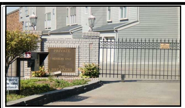
VOLUME 6, ISSUE 1